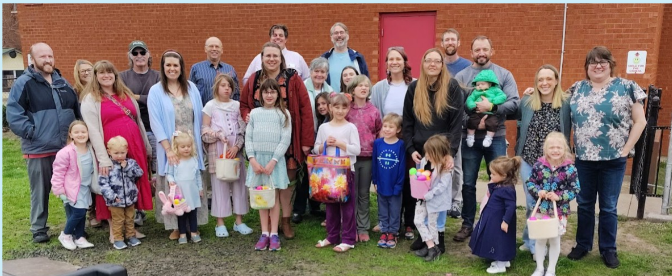
All of our intrepid hunters!