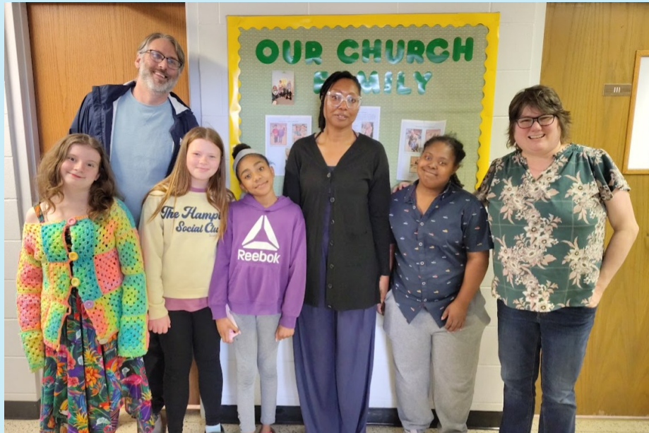
Our deputy easter bunnies for the day!