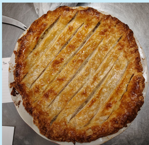
Pineapple Pie— check out that shine!