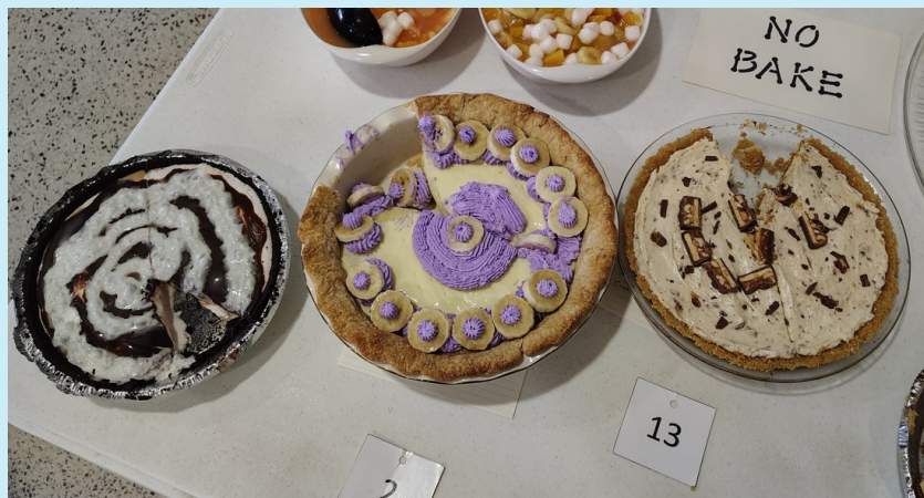
Mississippi Mud, Banana Cream, and Snickers Pie