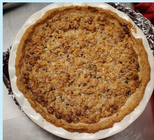
Trash Pie— I hear the filling was delicious.