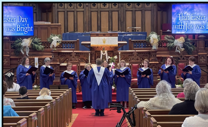
Salem Choristers filling the sanctuary with music on Easter Sunday.