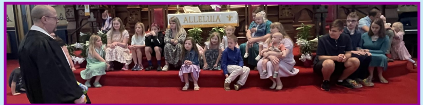
What a great turnout for the Children's Message on Easter Sunday!

keyboard/piano at 9:00am. This would mean we would continue to feature the Breathe Deep service on the first Sunday of the month, but move back to our original 9:00am service time for all worship services, followed by fellowship time and Re:Charge Christian education.