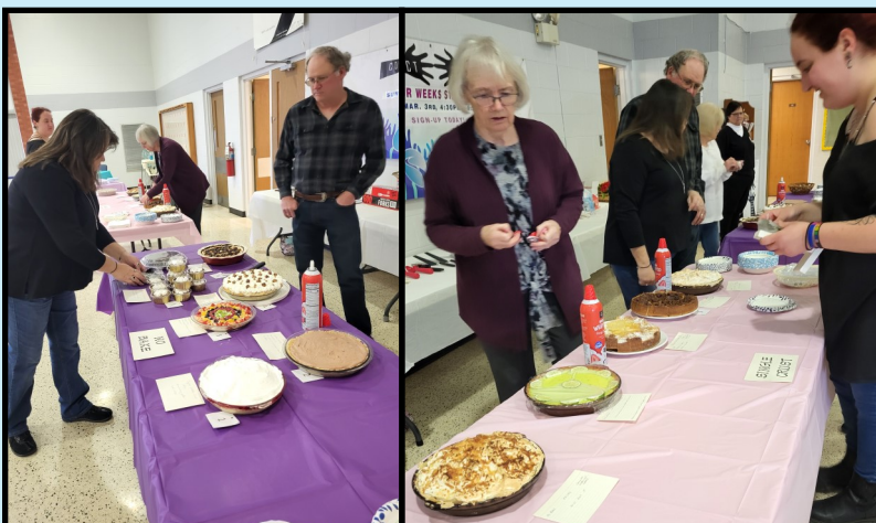
Getting ready for the judging at the Pie in the Sky contest—clearly it will be a difficult decision.