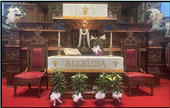
The sanctuary was decorated with lilies donated by Salem members as memorials for of loved ones.