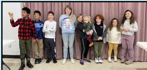
An attractive bunch waiting for the go-ahead to find those eggs and the goodies within.