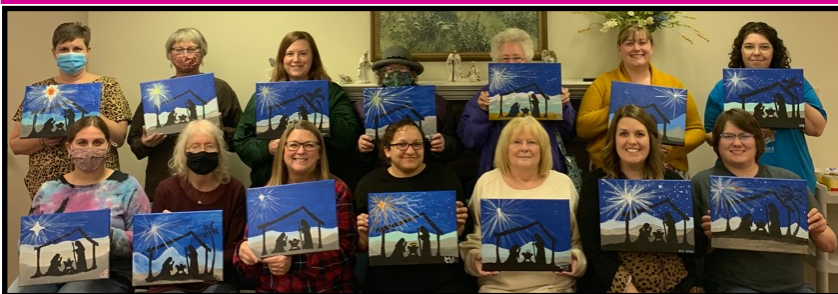
Happy participants at the first Salem Paint Night

Bring a friend and be entered in a drawing to attend the next Paint Night FREE.